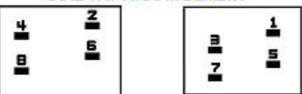
COIL TAP ARRANGEMENT