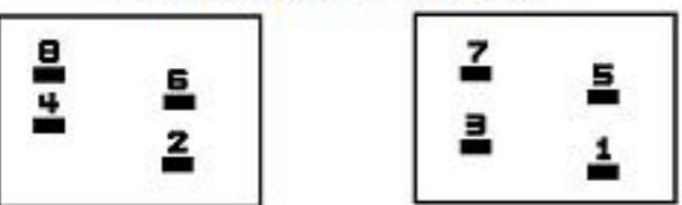
COIL TAP ARRANGEMENT