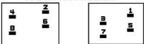
COIL TAP ARRANGEMENT