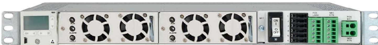
↑ OS TB - some models

Models: J2007003L102B - alpha suffixes per Slimline Power System Brochure