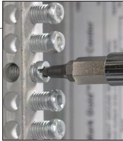
GE gives you a headstart on installation

In addition to all the other features that lower your cost by making installation faster and easier, all PowerMark Gold load centers from GE now come with neutral screws in the raised position – just insert the wire and tighten.