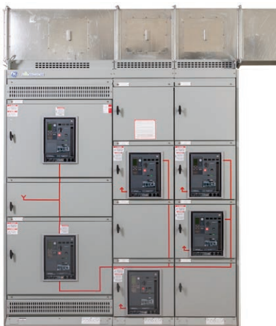
AKD-20 Arc Resistant (AR)