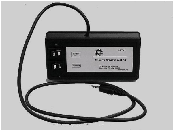
Fig 1: Spectra Breaker Test Kit

STEP8: Remove the phone jack from the Spectra Breaker rating plug.