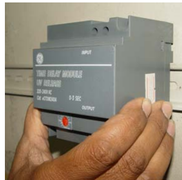
Figure 3. Din rail mounting

7. Alternatively TDM can be mounted on a din rail as shown in the fig 3.