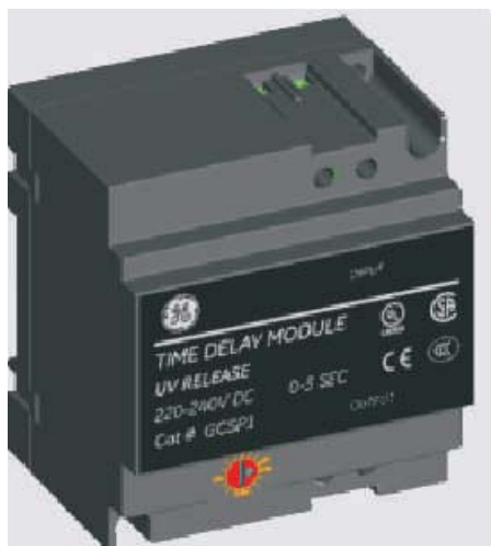
Table 1. Catalog Numbers and Ratings

The de-energizing operation of the undervoltage release can be delayed. This optional, externally mounted, module has an adjustable time delay of one to three seconds. The device can be implemented to prevent un-desired Breaker 'tripping' due to momentary voltage outages (50% of rated Voltage) and is connected in series with the under voltage release. The delay is in addition to the Under Voltage Release delay of 50 msec. The breaker must have a UVR installed for the External Time Delay Module to work.