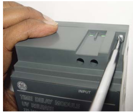
Figure 2. TDM mounting

6. Assemble the TDM module with two M4 screws as shown in the fig 2.