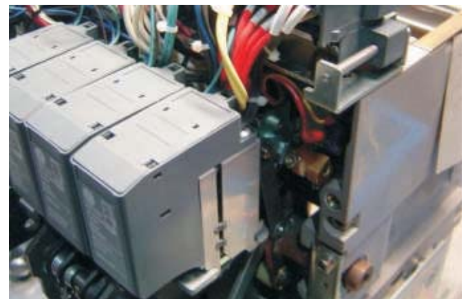
Figure 4. Snap on.

6. Tilt the device backwards until the rear hooks engage in the slots on the mechanism top support plate as shown in the Fig. 4