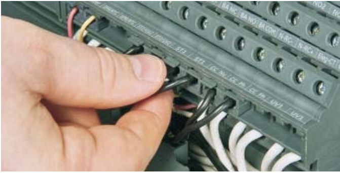
Figure 5. Wire assembly

8. Ensure that the plug in connection is firm and that the plug is inserted into the correct terminals.