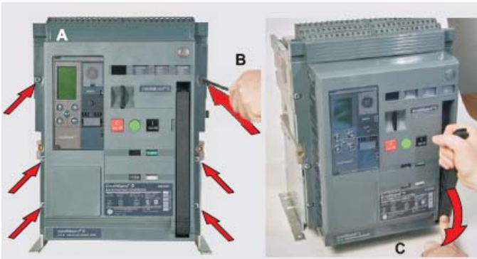
Figure 1. (A) Front Cover (B) Screw Removal (C) Handle Rotation

hooks into the mechanism top support plate as shown in the Fig. 3.