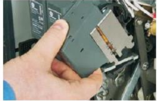
Figure 3. Shunt Trip Inserting

rear hooks engage in the slots on the mechanism top support plate as shown in Fig. 4.