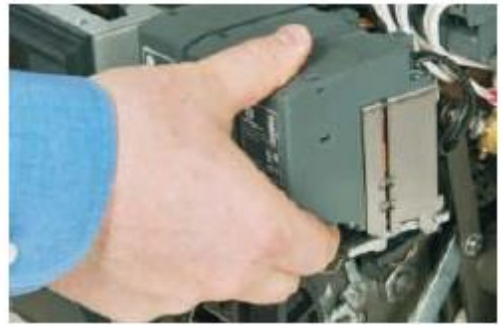
Figure 4. Shunt Trip Assembly

6. After installing the shunt release on the mechanism top plate, connect the input wire assembly plug to the A5/A6 (if installed in the first location) or A12/A13 (if installed in the fourth location) locations marked on the secondary disconnect as shown in Fig. 5.