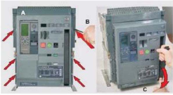
Figure 1. (A) Front Cover (B) Screw Removal (C) Handle Rotation

4. This accessory is mounted on the mechanism top plate at 1st or 4th location as shown in Figure 2.