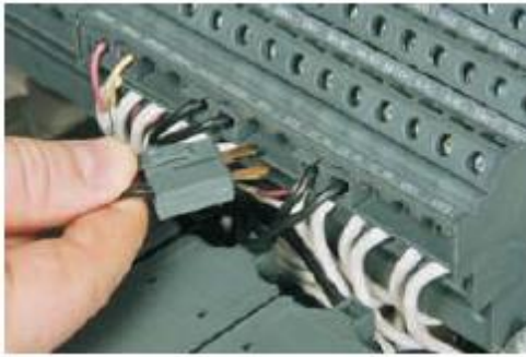
Figure 5. Wiring.

7. Ensure that the plug in connection is firm and that the plug is inserted into the correct terminals.