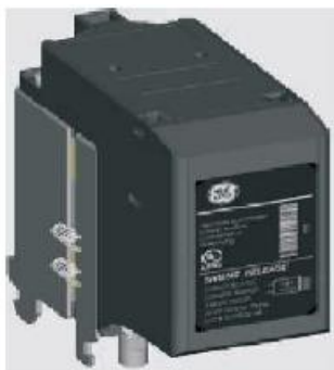
Table 1. Catalog Numbers and Ratings

Two Shunt trips can be mounted in each Power Circuit Breaker. The devices are available as factory mounted components or as field mountable devices. It is an easy-to-fit, clip-on unit, with simple plug-in connectors to the Secondary Disconnect Block.