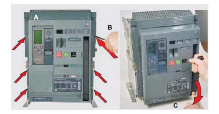
Figure 1. (A) Front Cover (B) Screw Removal (C) Handle Rotation

2. Loosen the 6 screws on front cover (fascia) using a posidrive screw driver as shown in Fig 1.B Rotate the charging handle down and slide the front cover over the handle to remove the front cover as shown in Fig. 1.C.