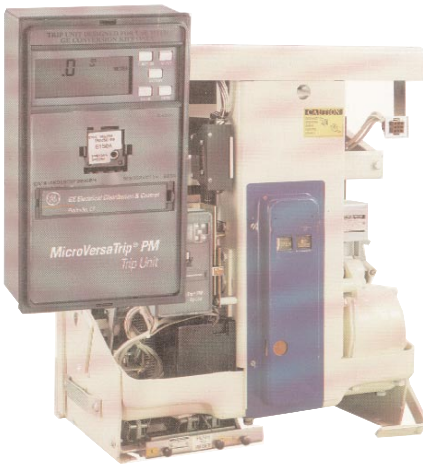
GE AKU-2A-50 with MicroVersaTrip PM trip unit upgrade