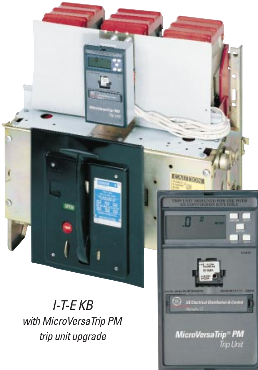
I-T-E KB with MicroVersaTrip PM trip unit upgrade