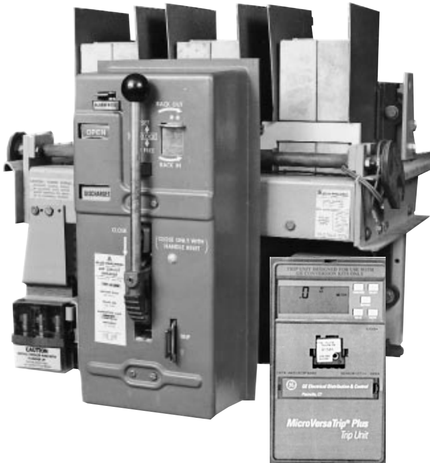
Allis Chalmers LA1600 Blue with MicroVersaTrip Plus trip unit upgrade