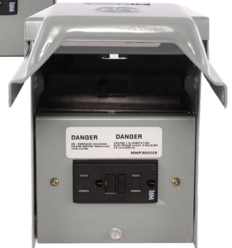
Non-automatic switch model TNA60RGFR