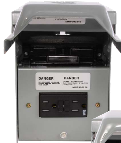
Non-fused pullout model TFN60RGFR