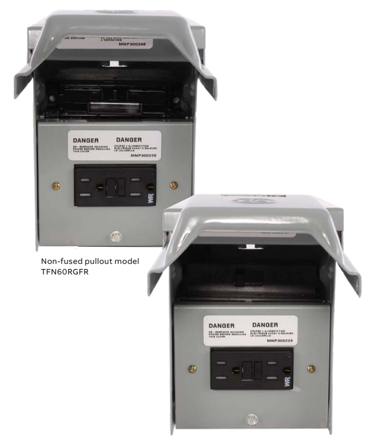
Non-automatic switch model