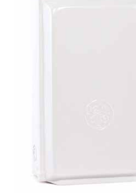
Ring-Type Metered Surface Mount