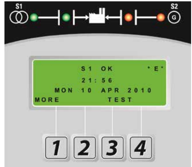
MX 150 Control Panel