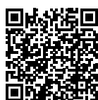
ABB Technical Services +1 (800) 637-1738