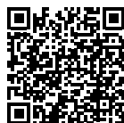
ABB Technical Services +1 (800) 637-1738